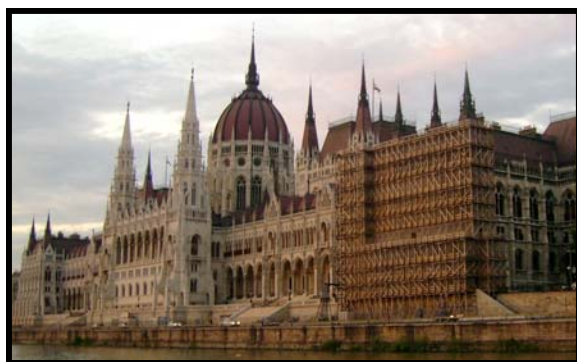
This photo is of a Building of Parliament in Hungary and represents one of many with amazing architecture.

Overall, I would say that this experience has made this the best summer of my life. It has taught me many life lessons including the importance of being open to different cultures and the ability to be willing to try new things. I highly recommend going to Europe at least once in your life. It could be the best vacation that you will ever take. I guarantee it!